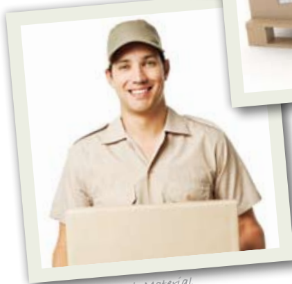
SMACS Flex + Material